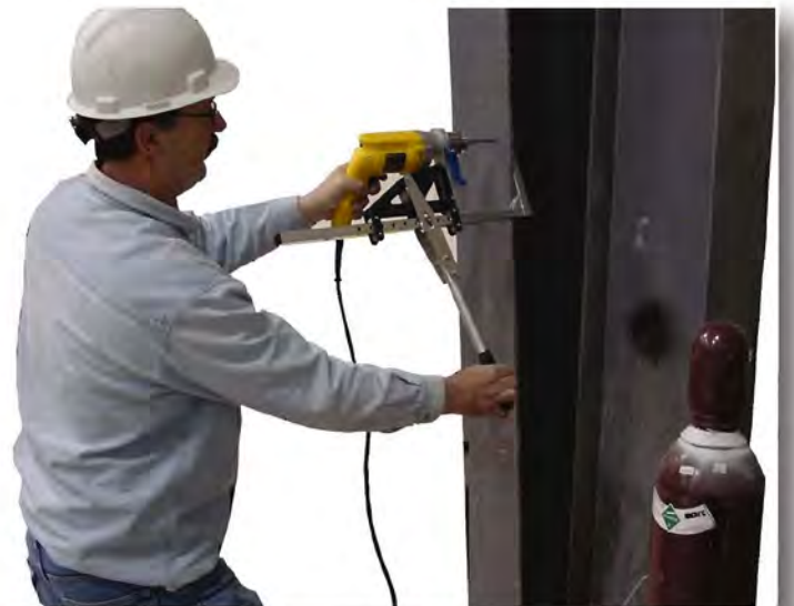
Drilling Down / Pulling In