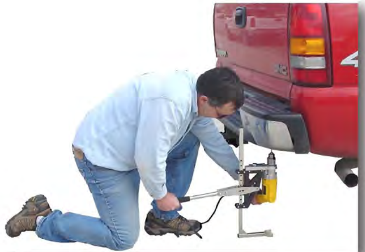
Drilling Up / Pushing In